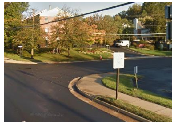
→ Freedom Bail Bonds →

Mailing Address: 14001C Saint Germain Drive, #296, Centreville, Virginia 20121