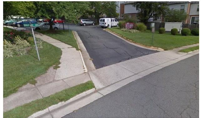
This is the immediate left into Railroad Square

Our elevator is in the lobby of the second building entrance on 10640 Railroad Square (there is a metal rail that you have to travel around) and we are on the second floor, in suite 203, on the same side as and directly to the left of the elevator (the Farr Law Firm is across the hall).