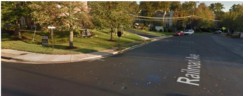
← PNC Bank at Judicial ← Railroad Avenue from Main Street